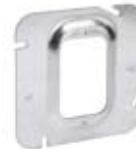
TP574-TP582, TP529, TP531