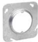
TP569, TP570, TP571 TP573, TP575